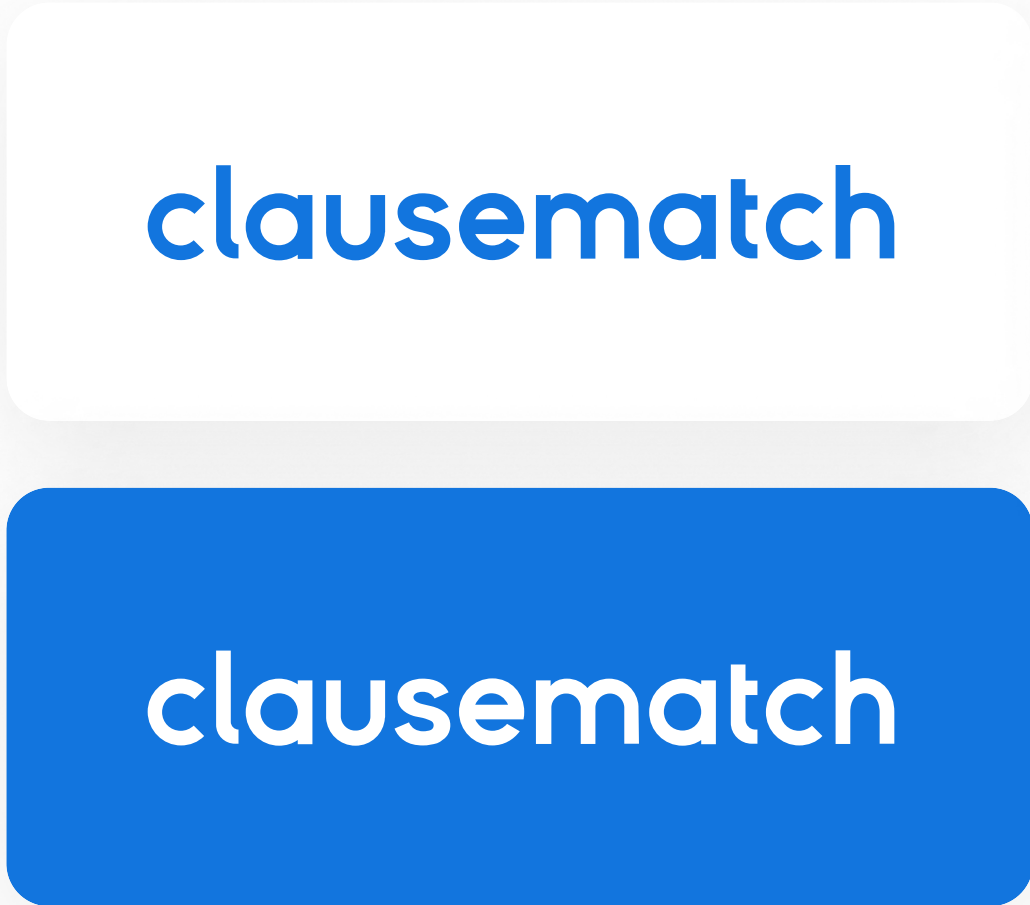
Primary logo colors